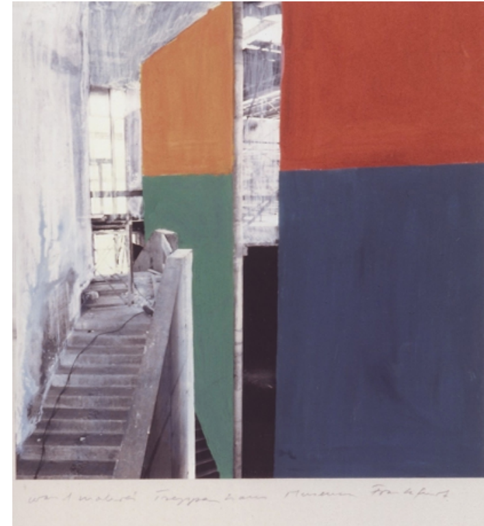
Günther Förg: Wandmalerei, MMK Frankfurt, 1991 12.3m x 7.2m